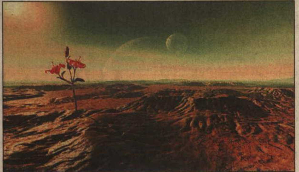
RED PLANET TO GO GREEN

The winning payload will arrive on Mars in 2018 together with the official Mars One experiments.